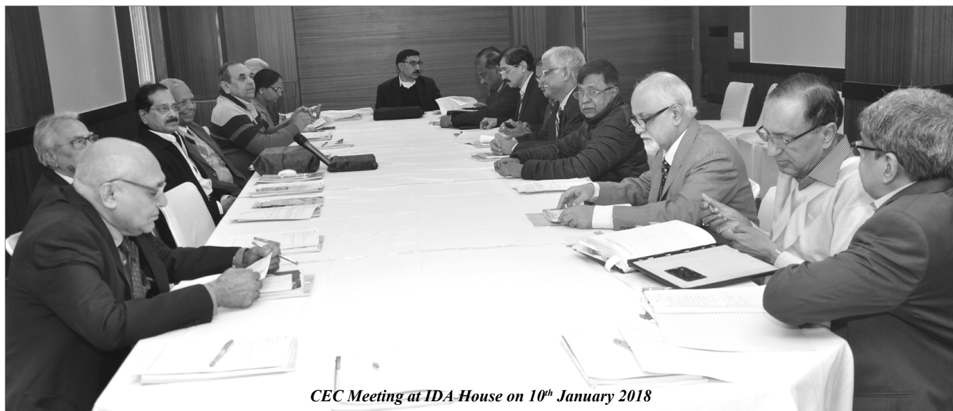
CEC Meeting at IDA House on 10 th January 2018

As the new CEC assumes office we wish all its members the very best for their tenure.