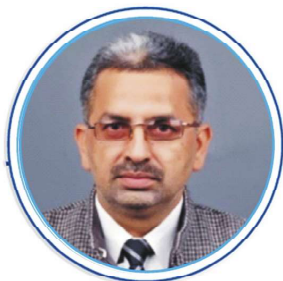
DR PRAVEEN MALIK Animal Husbandry Commissioner, Govt. of India